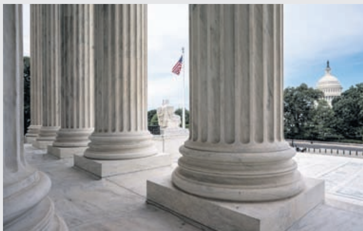
The columns of the Supreme Court are seen with the Capitol at right, in Washington, early Monday, June 15, 2020.